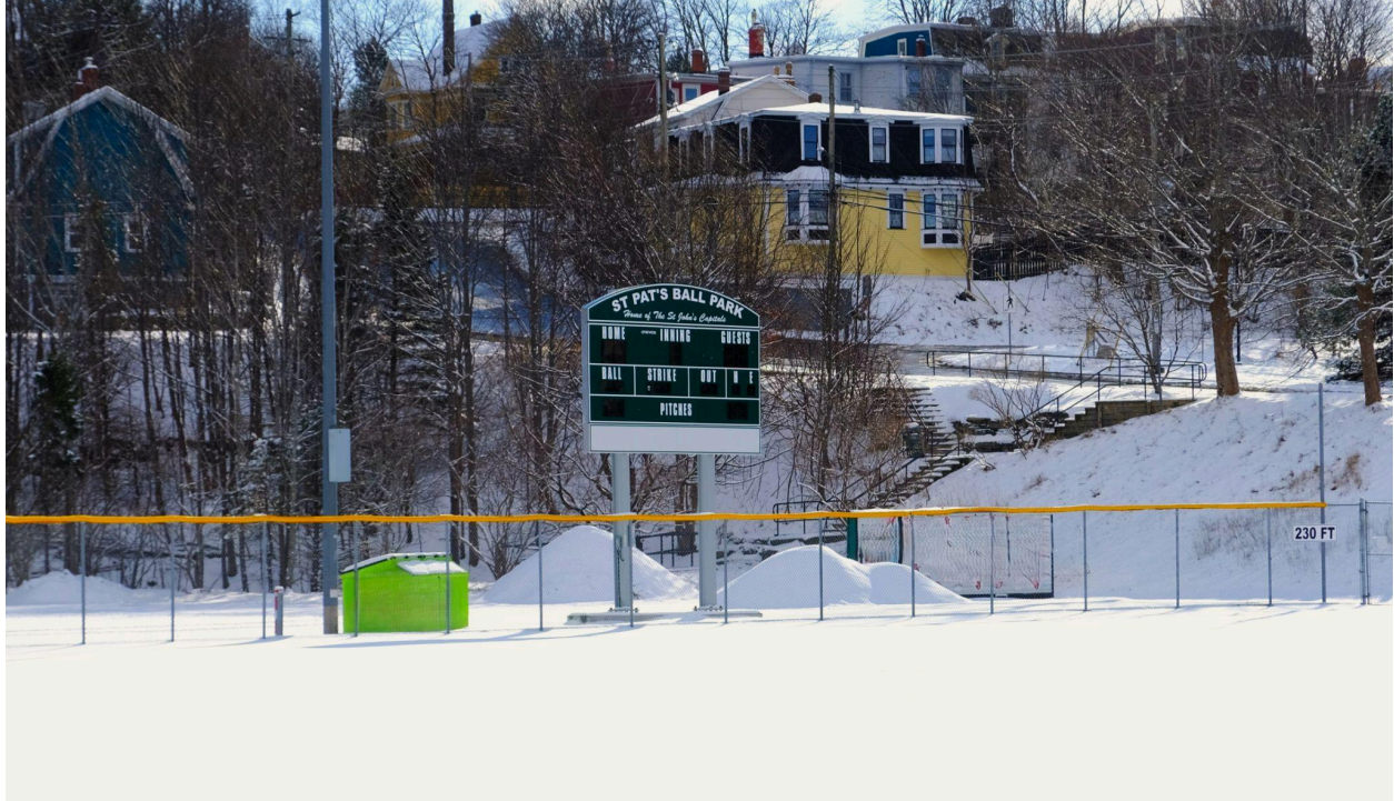
(view of scoreboard from Left Field / Parking Lot / End of Driveway)