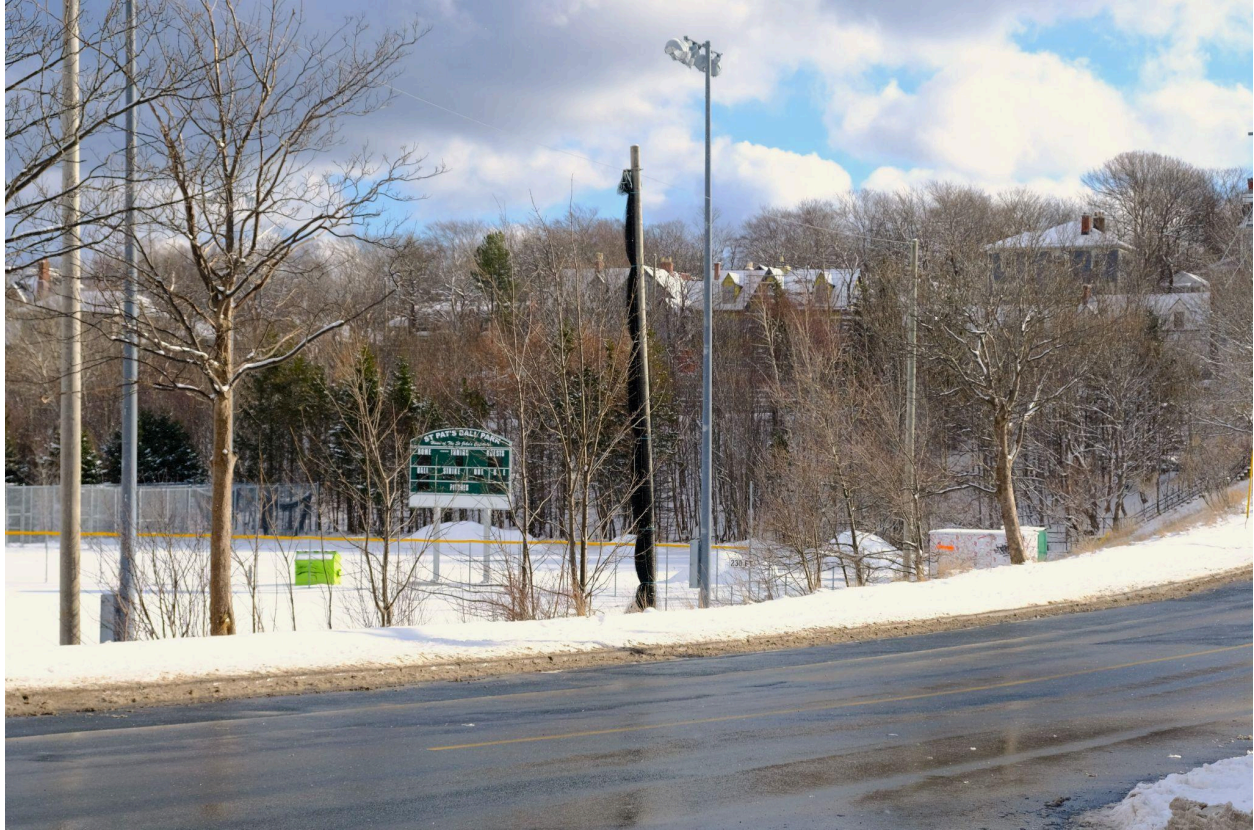
(view of scoreboard from Carpasian Road)