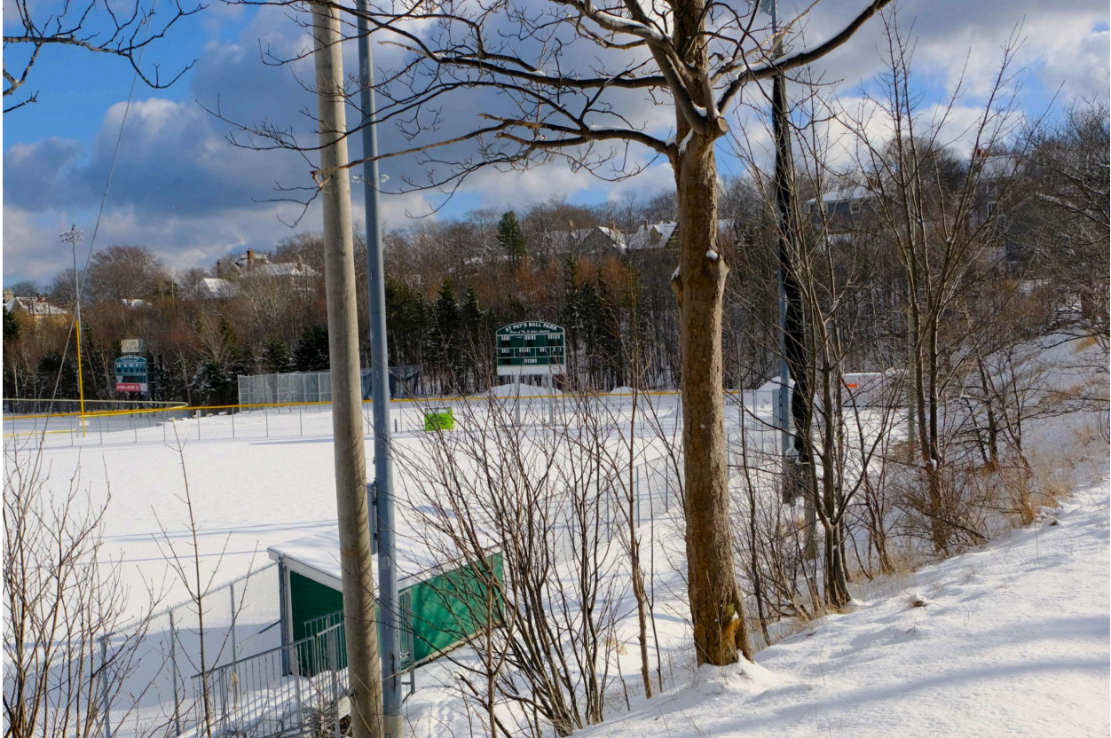
(view of scoreboard from entrance to the park)