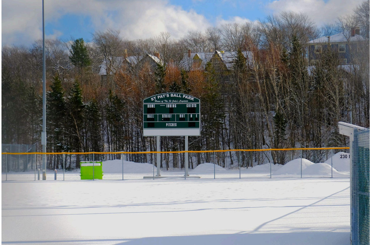
(view of scoreboard from behind backstop)