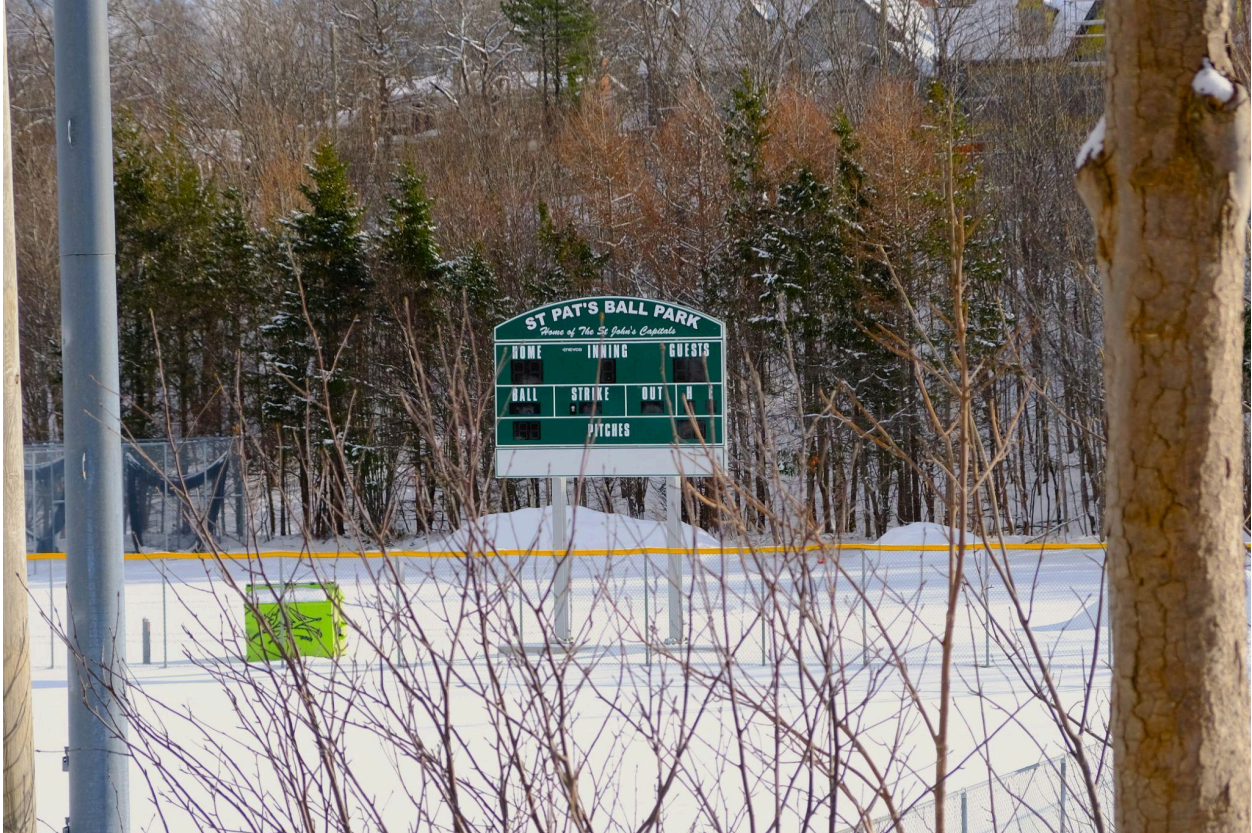
(enhanced view of scoreboard from entrance to the park)